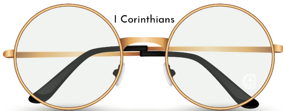
A Call to Faithful Living

NEW ADULT FAITH FORMATION CLASS | SUNDAY SCHOOL begins January 7, 2024