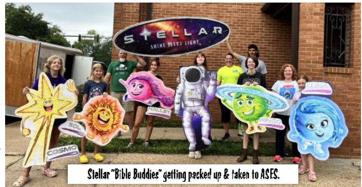
Stellar "Bible Buddies" getting packed up & taken to ASES.