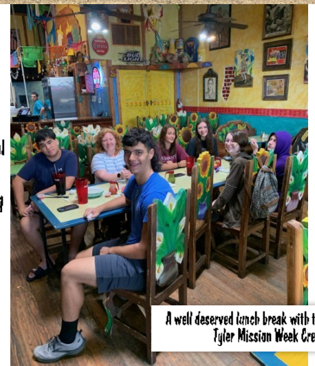
A well deserved lunch break with the Tyler Mission Week Crew.