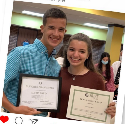
Scholarship Recipients Christ Church Tyler