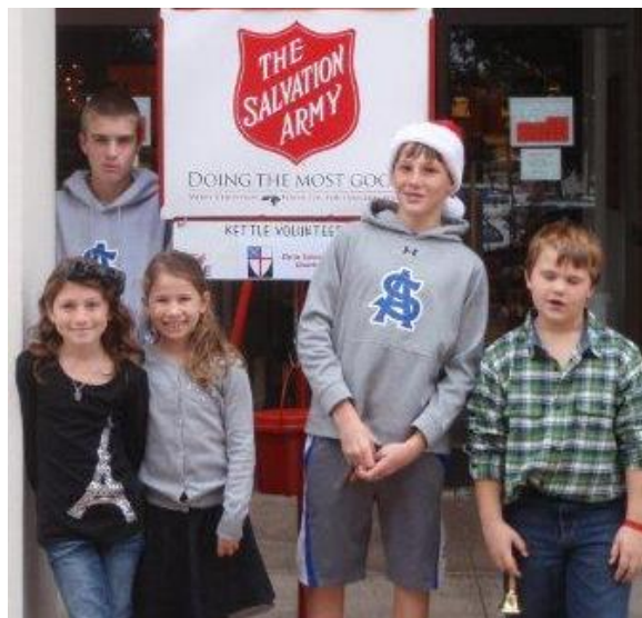
E-kids, Jr. E-kids, EYC Fish and Jr. EYC rang bells at Macy's.